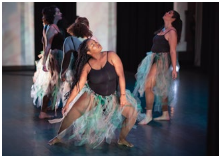
Senior Choreographers' Concert: Continuum