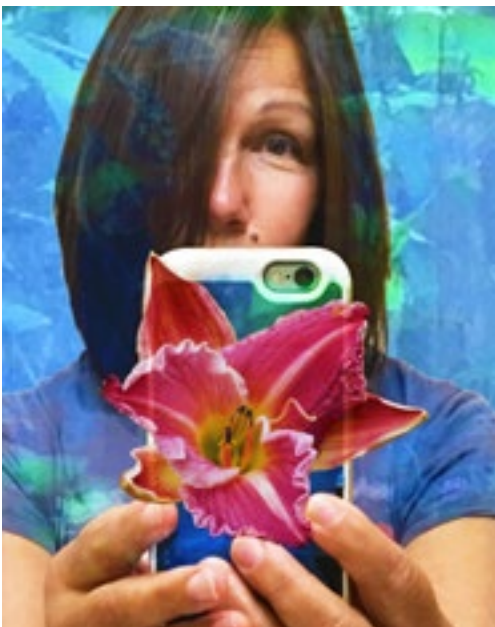
The Art of Inkjet Transfer