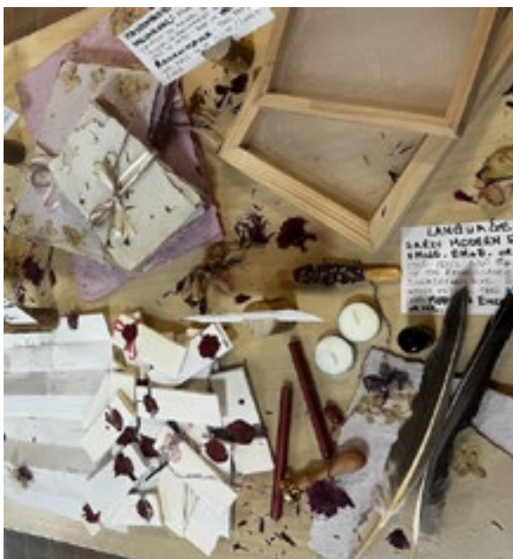
Early English Language and Writing Technologies

5:45 p.m. to 7:00 p.m., Sheard Literacy Center Balcony