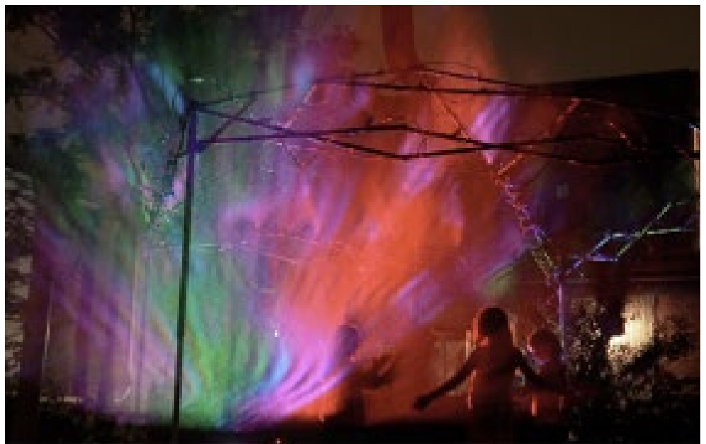
LoKo Arts Festival Highlight Event - Glow Night